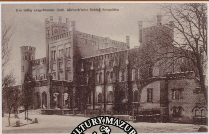
Das völlig ausgebrannte Gräfl. Mirbach'sche Schloß Sorquitten